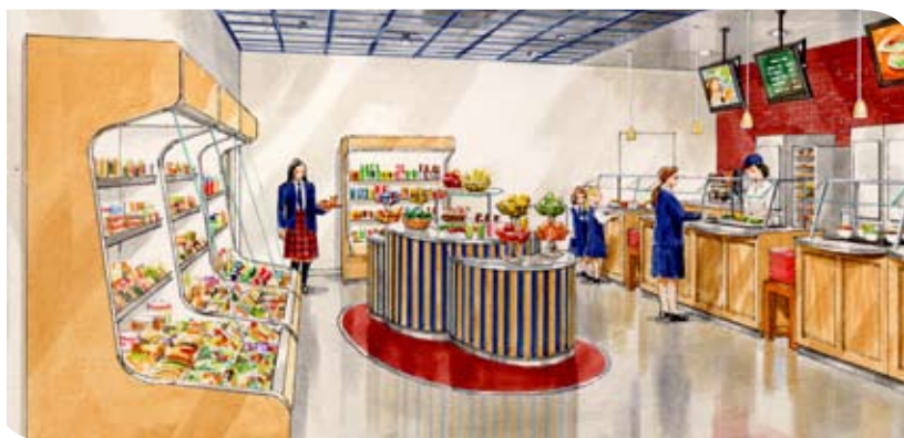
Artist's rendering of the new SMLS servery being built for occupancy in March 2011.

To discover the opportunities available to your daughter, call us for a tour – 905-845-2386.