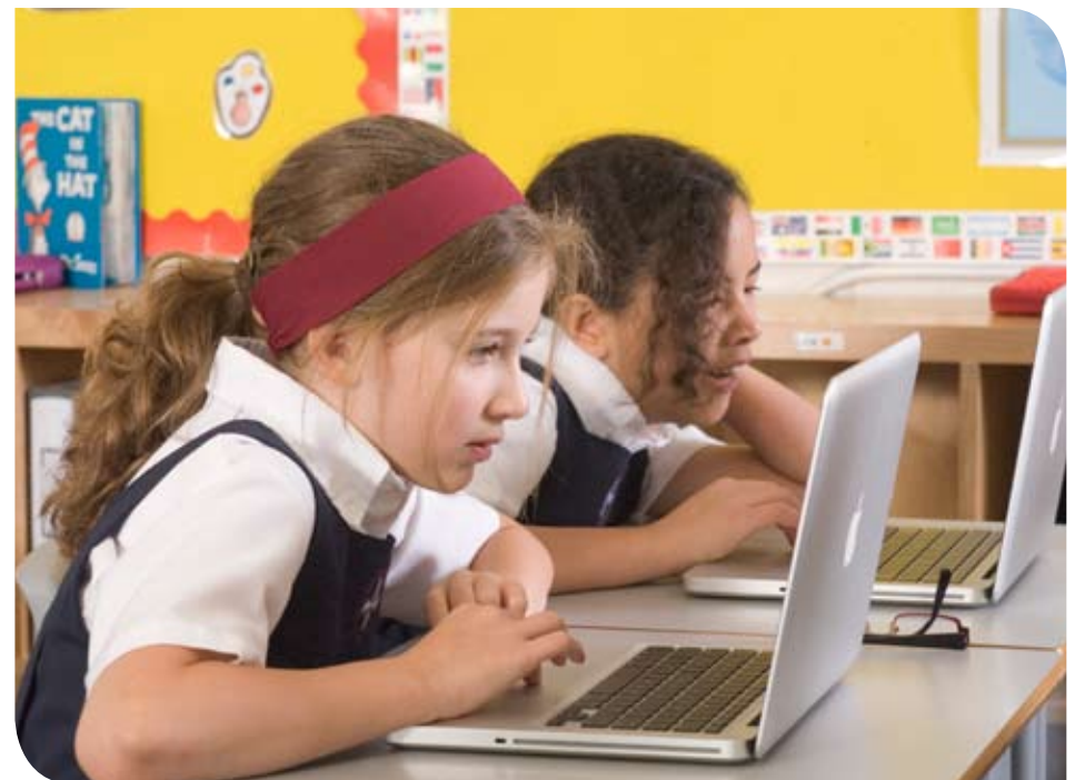
The laptop program begins in Grade 6 at St. Mildred's-Lightbourn School. All students in the Senior School are assigned a computer for their use.